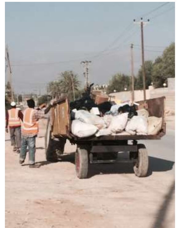
Figure 3: Waste transportation in Zone No. 8 in Misurata