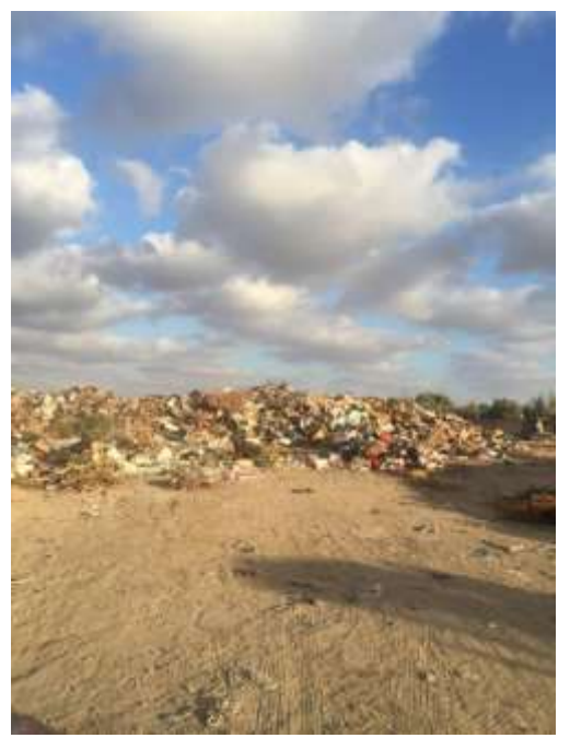
Figure 4: One of an open dumping sites in Misurata